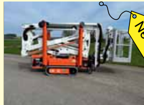
21838 - Easylift RA15 15m -230V&Petrol- year '24

If interested, please mark devices in checkboxes and return to us with the "send" button on page 2