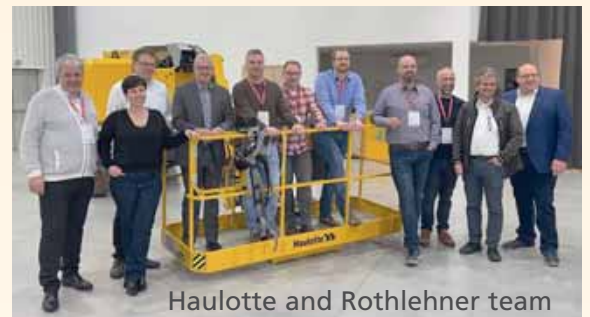
Haulotte and Rothlehner team