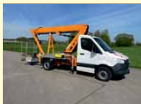
19883 - GSR B220TJ 22m - MB 15k km - year '21