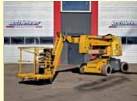
8672 - Haulotte HA15IP 15m - Battery - year 2005