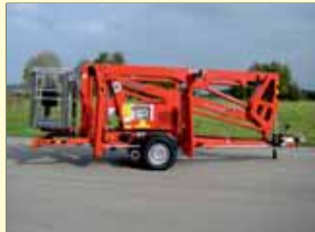
26056 - Europelift TM16GT 15,8 - 230V & Petrol - 2023