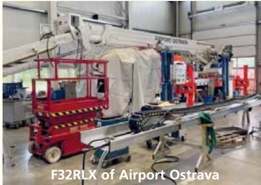
F32RLX of Airport Ostrava

Whether airports, industrial companies or municipalities, the workshop doors at Lift-Manager are regularly opened for various BRONTO firefighting aerial rescue platforms.