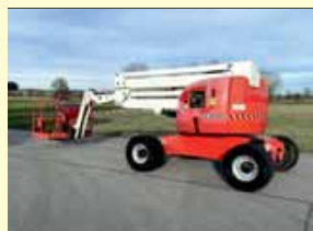
24783 - JLG 510AJ 17,8m - 4x4 Diesel - year '14