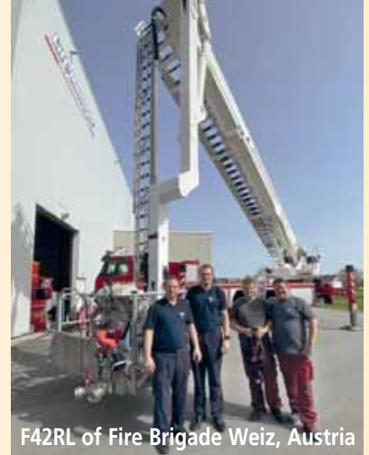
F42RL of Fire Brigade Weiz, Austria

The trained BRONTO team at Lift-Manager is commissioned for both short-notice maintenance and repair works, and also long-term planned 10-year checks which are specified based on standardised procedures.