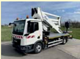
22848 - GSR E290PX 28,2m - MAN TGL - year '24