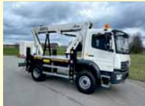
23135 - GSR B220TJ 22m - Diesel - year 2024