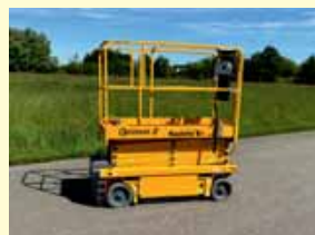
26033 - Haul. Optimum 8 8m - Battery - year 2021