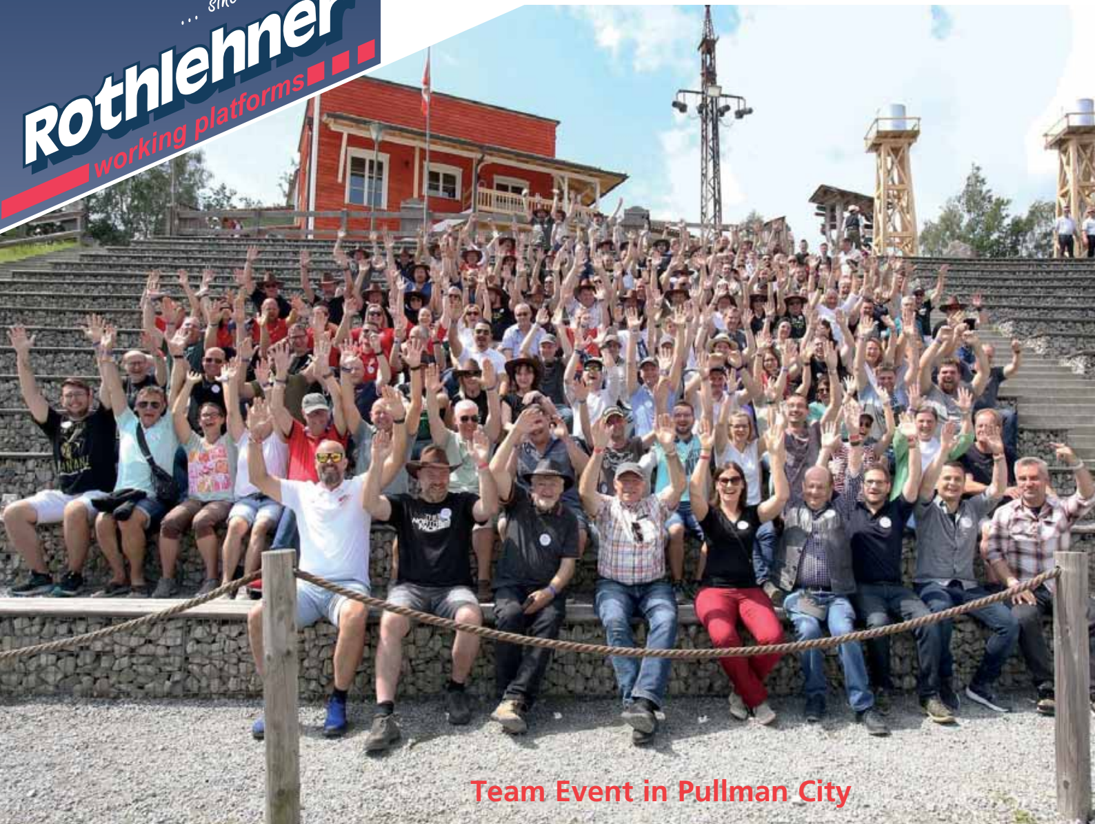
Team Event in Pullman City