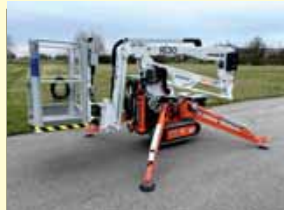
25774 - Easylift R130 13m - 230V&Petrol -Bj.2024