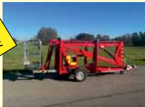
23850 - Europelift TM13G Eco 13m -230V&Petrol - Bj. 2024