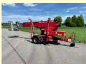
8893 - DENKA Dk18 18m - Battery - Bj. 2013