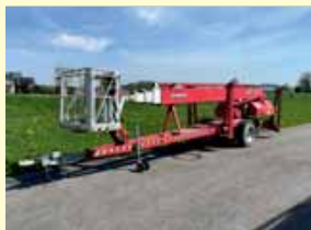
11991 - DENKA DL30 30m - Battery - year 2007