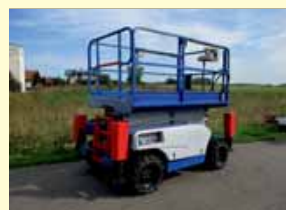
24387 - Haul. Compact 12DX 12m - Diesel 4x4 - 2007