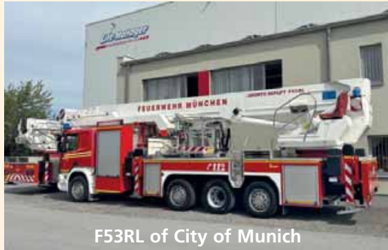
F53RL of City of Munich