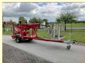
7413 - DENKA DL18 18m - Battery - year 2006