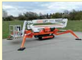
26042 - Easylift RA 31 31m - Battery & Diesel - '24