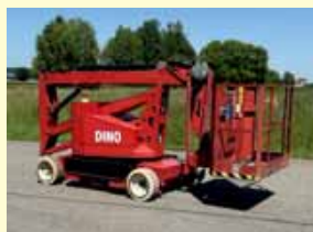
3525 - PB Dino 1210 12m - Battery - year 2002