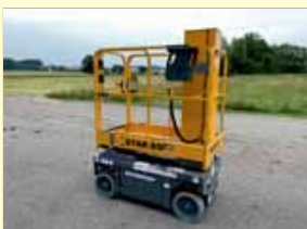
22741 - Haulotte Star 8S 7,95m - Battery - year 2021