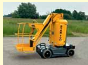
25101 - Haulotte Star10 10m - Battery - year 2021