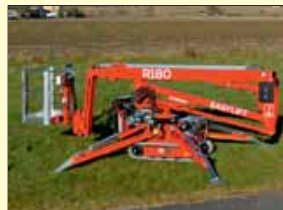
26174 - EasyLift R180 18m -230V & Petrol - 2023