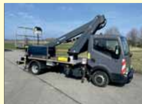
18014 - GSR B180T 17,7m - Nissan 50k km - 2024