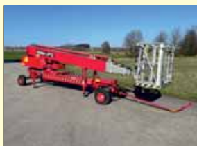
3201 - DENKA DL28N Narrow 28m - Battery - year 2001